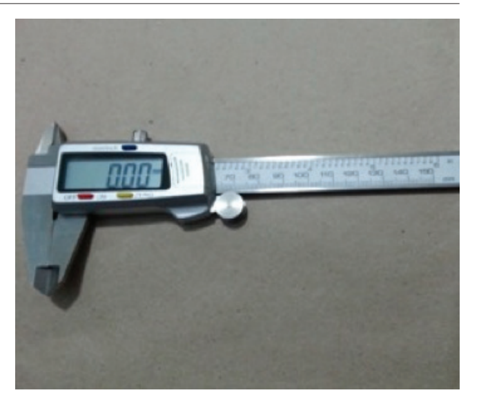
Figure 1. Calipers used for measurement of penile size in the newborn

The exclusion criteria for infants were as follows: ambiguous genitalia, hypospadias, epispadias, scrotal hyperpigmentation, undescended testis, hydrocele, dysmorphism, and multiple congenital abnormalities. The antenatal history and the condition of each infant were carefully evaluated. Having a family history of urogenital disorders, still births, deaths immediately after birth, or a maternal history of gestational androgenic treatment was also considered an exclusion criterion. The subjects were examined according to a prespecified protocol. The height and weight of every infant was measured first. The infants were weighed by two experienced nurses and their heights were also measured twice by a nurse. The penile lengths of the uncircumcised infants were measured at the supine position between 0 to 2 days of age, by extending the penis on a wooden tongue depressor but without stretching it. The distance between the penile radix and the penile glans was measured with digital calipers (Figure 1). While pressing down the pubis bone, one leg of the calipers was placed on the penile radix and the other was placed on the tip of the glans. The measurements were then recorded. The maximal penile diameter was also measured with digital calipers. All measurements were performed twice by the same physician having the assistance of nurses, and the mean values were recorded.